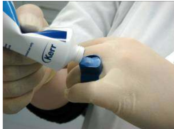
Fig. 1 (left): Cleanic ® in a tube