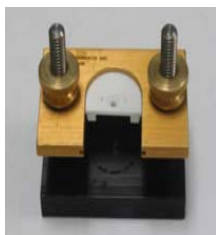
Figure 1: Bonding Jig

Statistical analysis was performed using One-way ANOVA and Bonferroni’s method for pair-wise comparison to determine significant differences among groups (p<0.05).