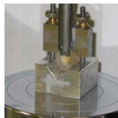
Figure 2: Shear Bond Test Set-Up